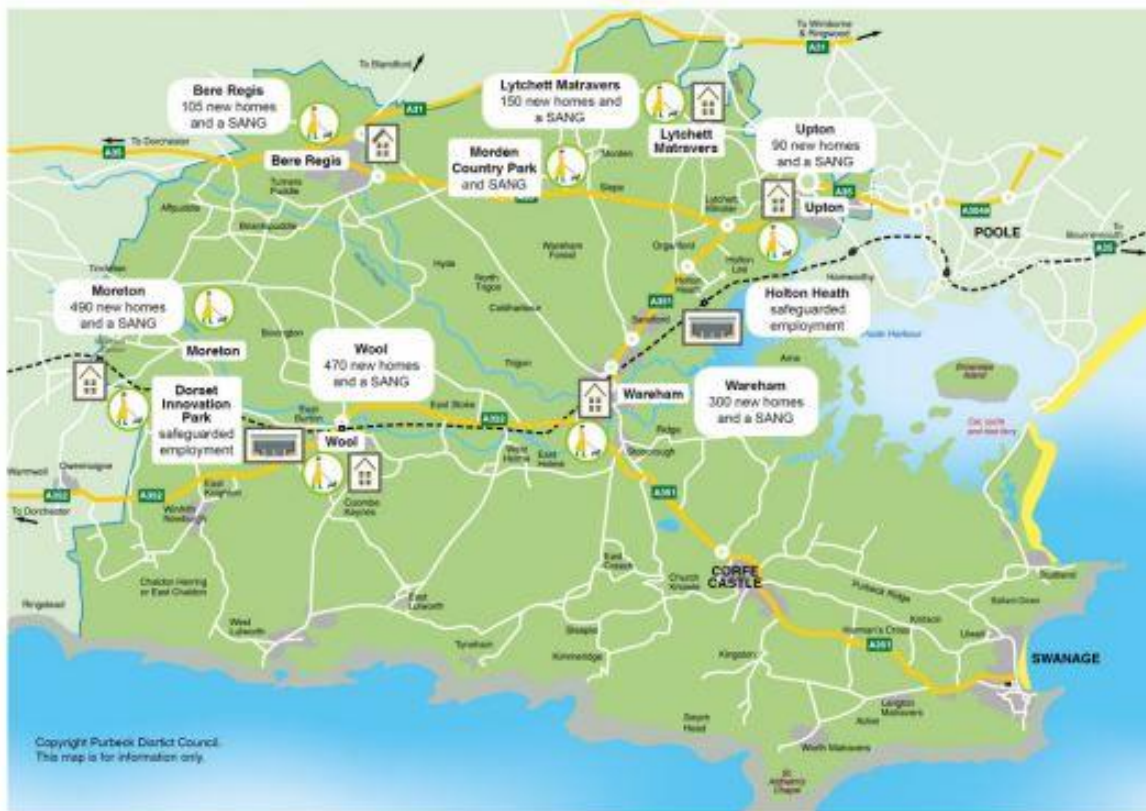
Key diagram: Purbeck District Council's spatial strategy