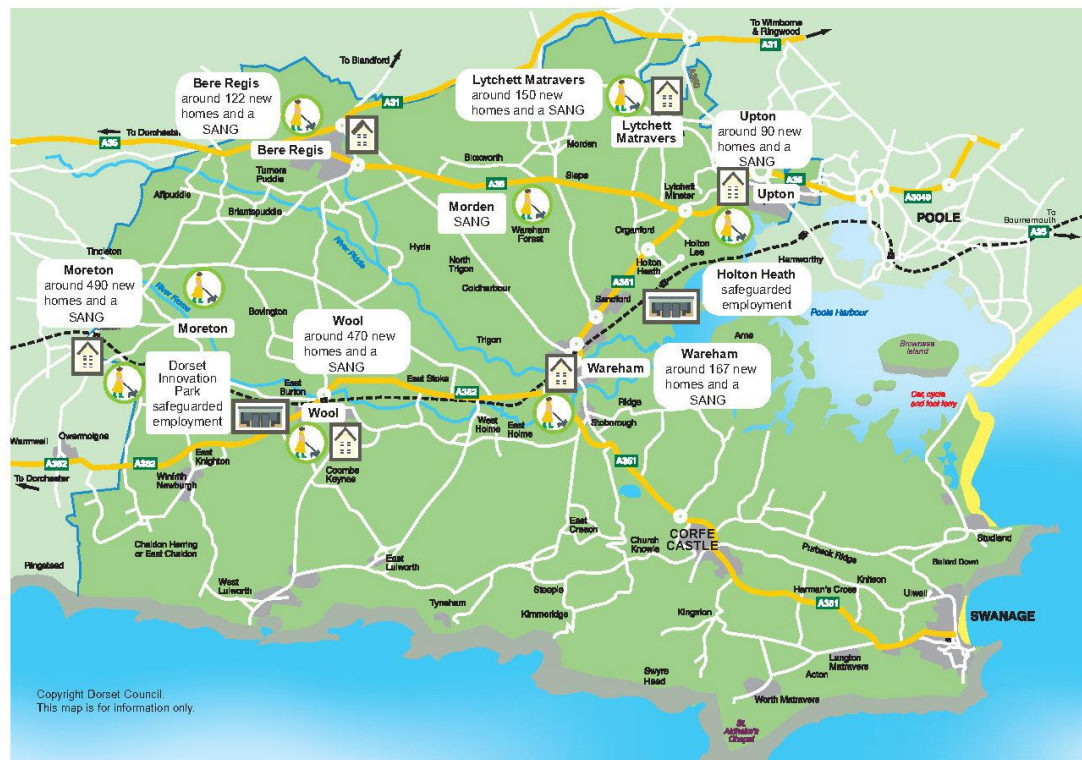
Key diagram: Purbeck's District Council's spatial strategy